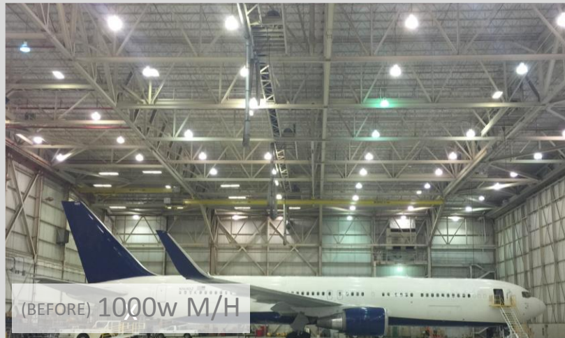
(BEFORE) 1000w M/H