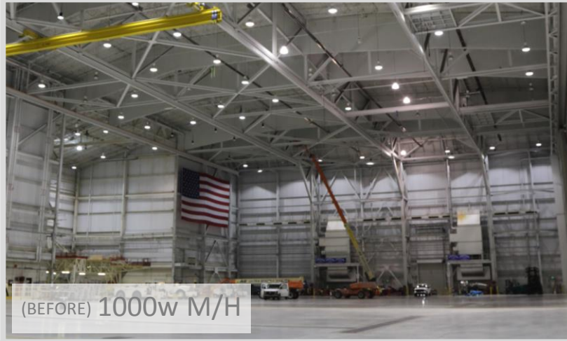
(BEFORE) 1000w M/H

SAVE UP TO 80% IN ENERGY COSTS WITH LED Light Source